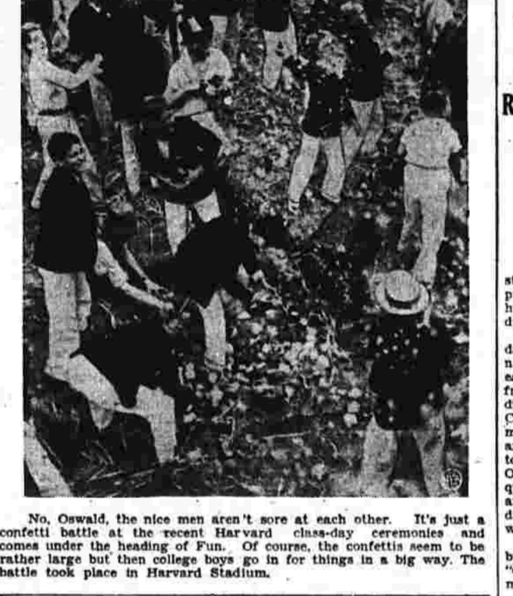
No. Oswald, the nice men aren't sore at each other. It's just a committal battle at the recent Harvard commencement ceremony. For of course, the confetti seem to be rather large but then college boys go in for things in a big way. The battle took place in Harvard Stadium.